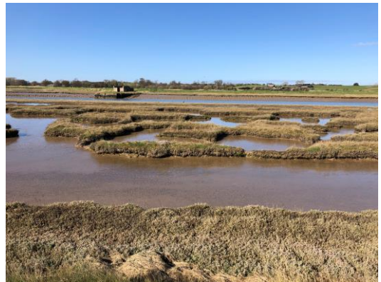
Widening Channel TM 395 474