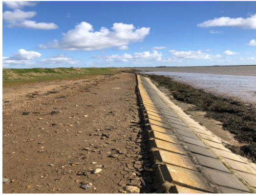
Armour Upstream of Pumping Station TM 411 475