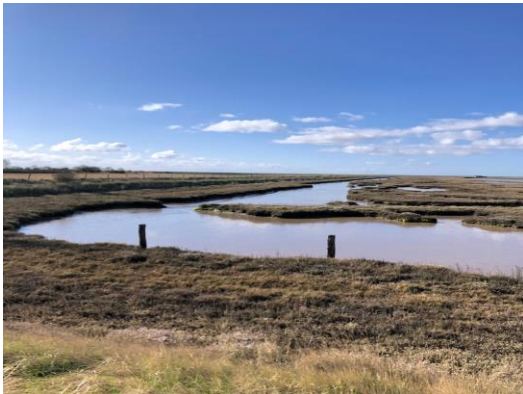
Inner Channel above Boyton Dock TM 394 482