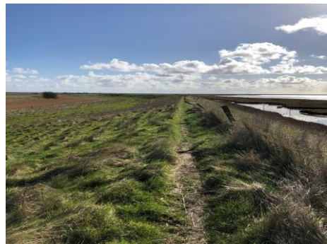
Worn Path TM 397 474