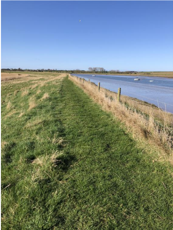
By Pinneys TM 397 486