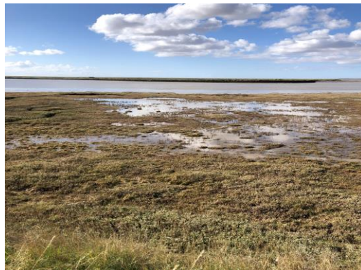
Tidal Water in Saltings TM 403 473