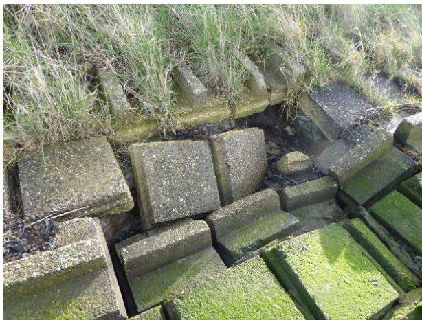
Image: Damaged block revetments to be repaired

We'll be doing “like for like” repairs to the flood embankment to return it the condition it should be in. This includes repairs to the concrete revetments, scour protection, and any worn areas, on the front face.