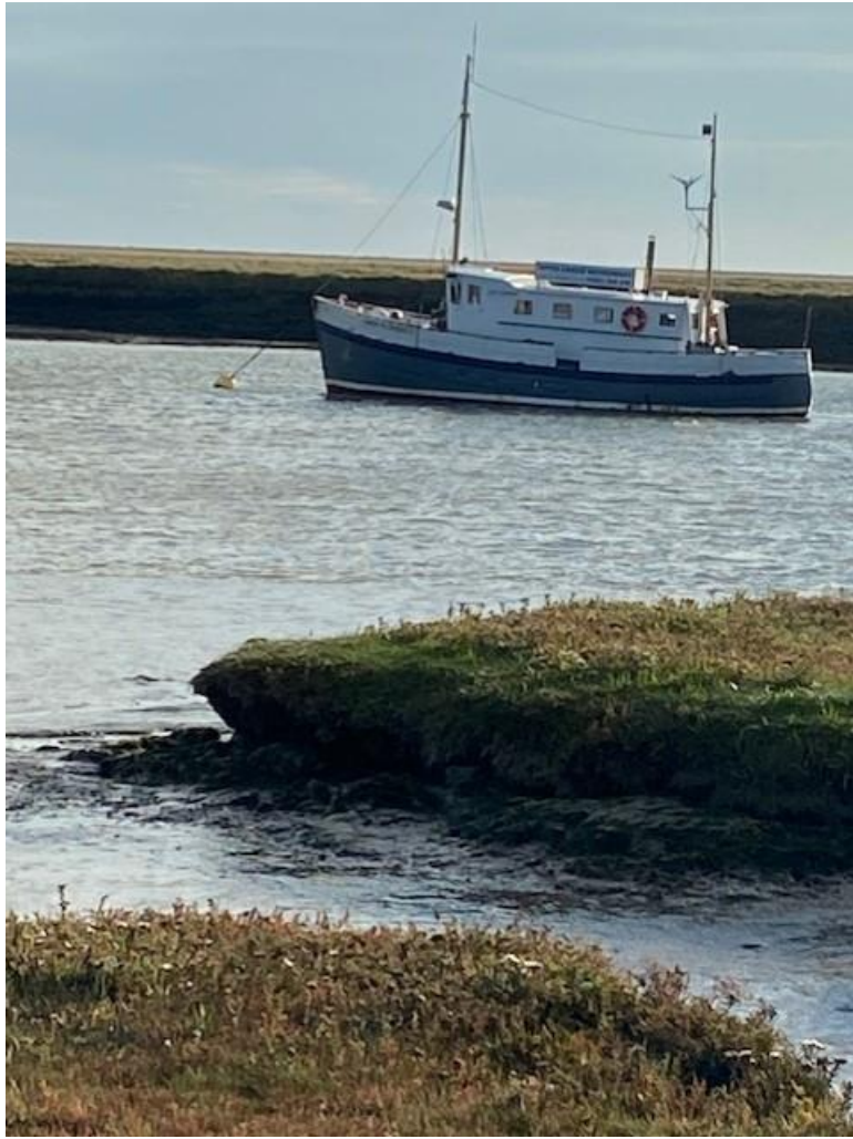
Photo 7 Saltings Erosion