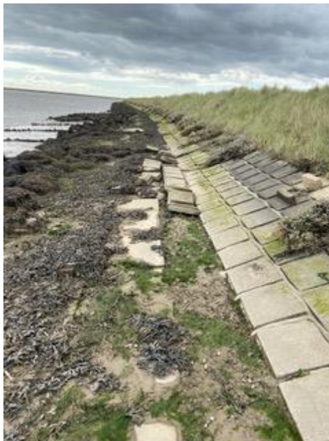
Photo 2 State of the armour

Showing the way in which the footpath is encroaching on the side of the wall