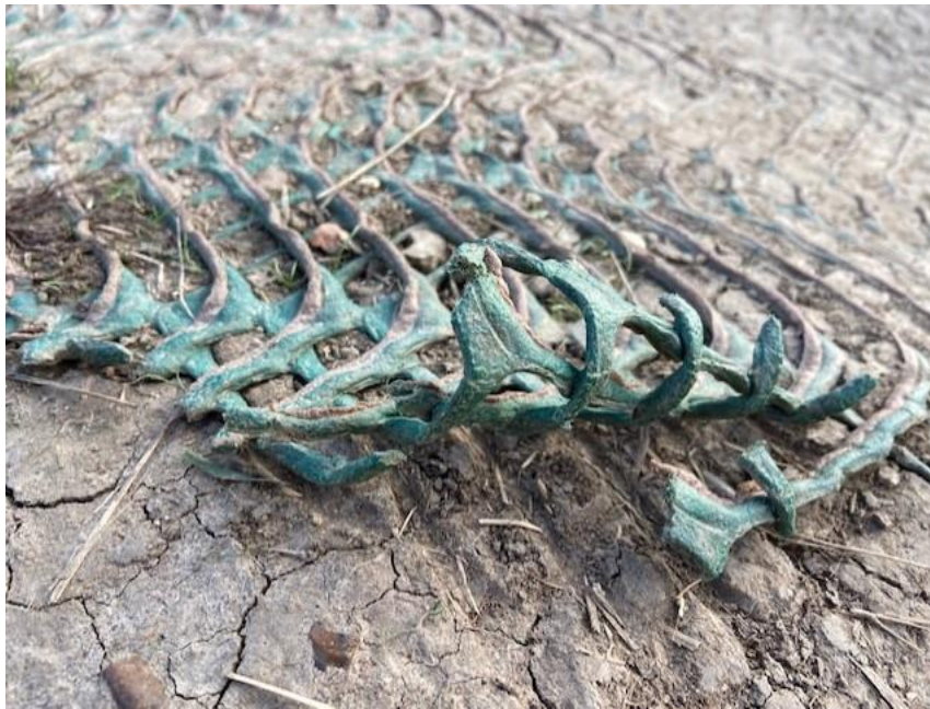
Photo 4 [and following photos] shows the condition of the webbing and possible trip hazards