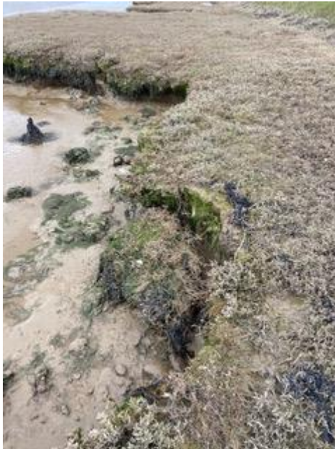
Photo 3 Showing a piece of saltmarsh detaching