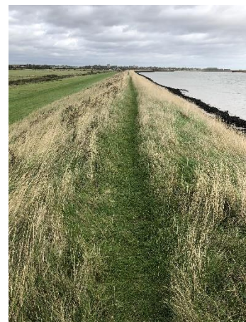
Towards Tide Gauge TM412 479