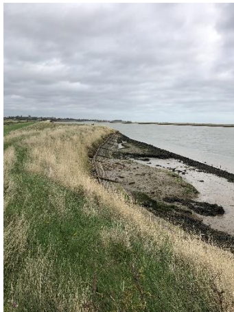
Armour at Gedgrave PS TM411 475

Outer Walls – generally good condition and no evidence of any change or deterioration