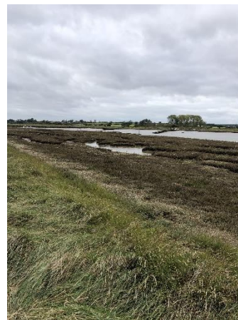
Channel Widening TM 394 479