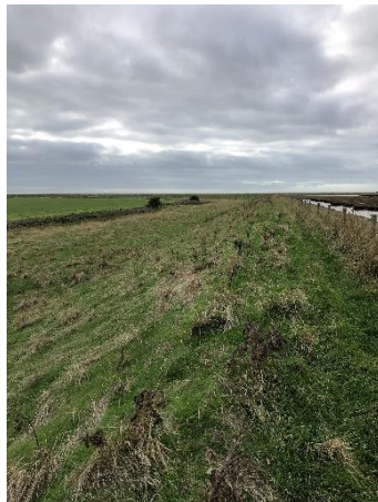
Above B Dock TM399 474