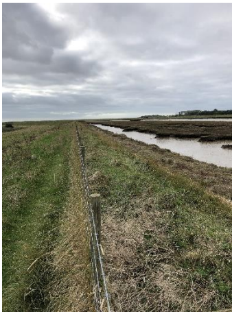
Channel above B Dock TM397 474 Long Gull TM400 474