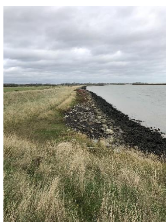
Shore twds Tide Gauge TM412 477