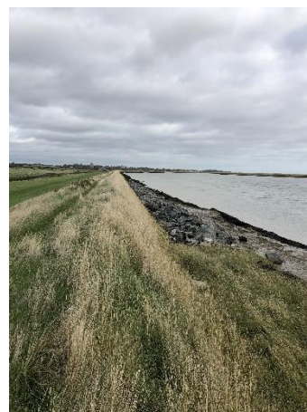
Further twd TG TM 412 478