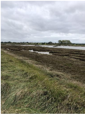
At Butley Ferry TM 395 484

Saltings: Further widening of channels and more undercutting around the Ferry; not so bad further downstream though inner channel along the LG still widening, some new undercutting.