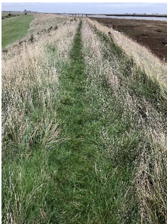
Path at Gedgrave PS TM407 472