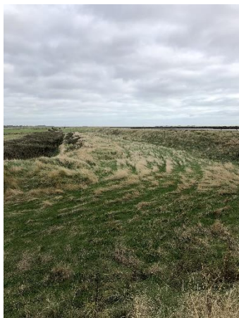
Twds Gedgrave PS TM411 475