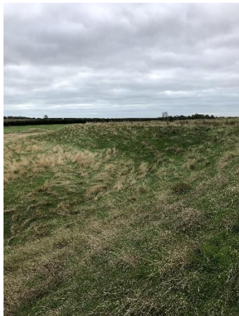
Boyton Dock TM395 474