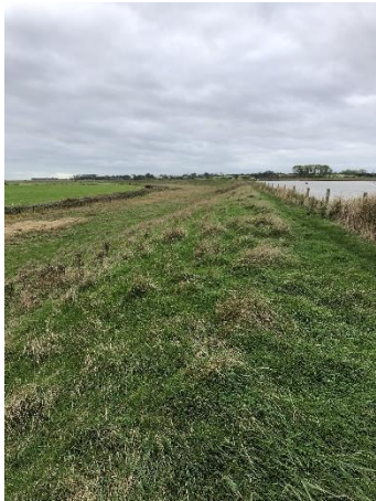
By Pinneys TM397486

Inner walls and pathway – all well grassed and no evidence of damage or change since last year; pathways past the pumping station showing some cracking despite recent rain and the lateness of the survey, but no slippage.