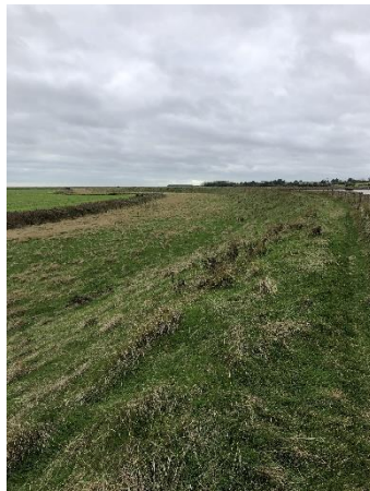
Opposite Ferry TM396 485