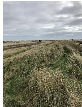
Towards Gedgrave PS TM406 472