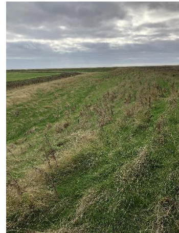
Above Ferry TM394 483