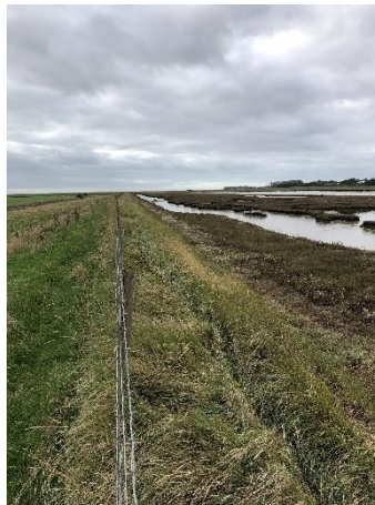
New undercutting and widening TM 407 471