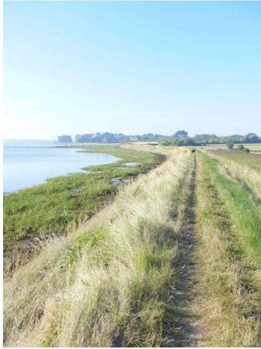
River Wall looking towards Brick Dock