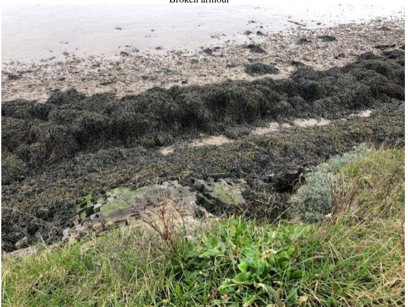
Broken armour at base of wall