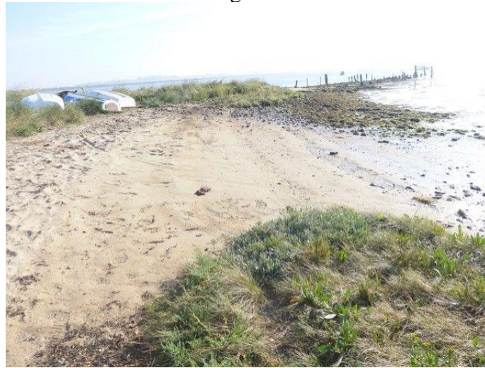
Beach and Jetty