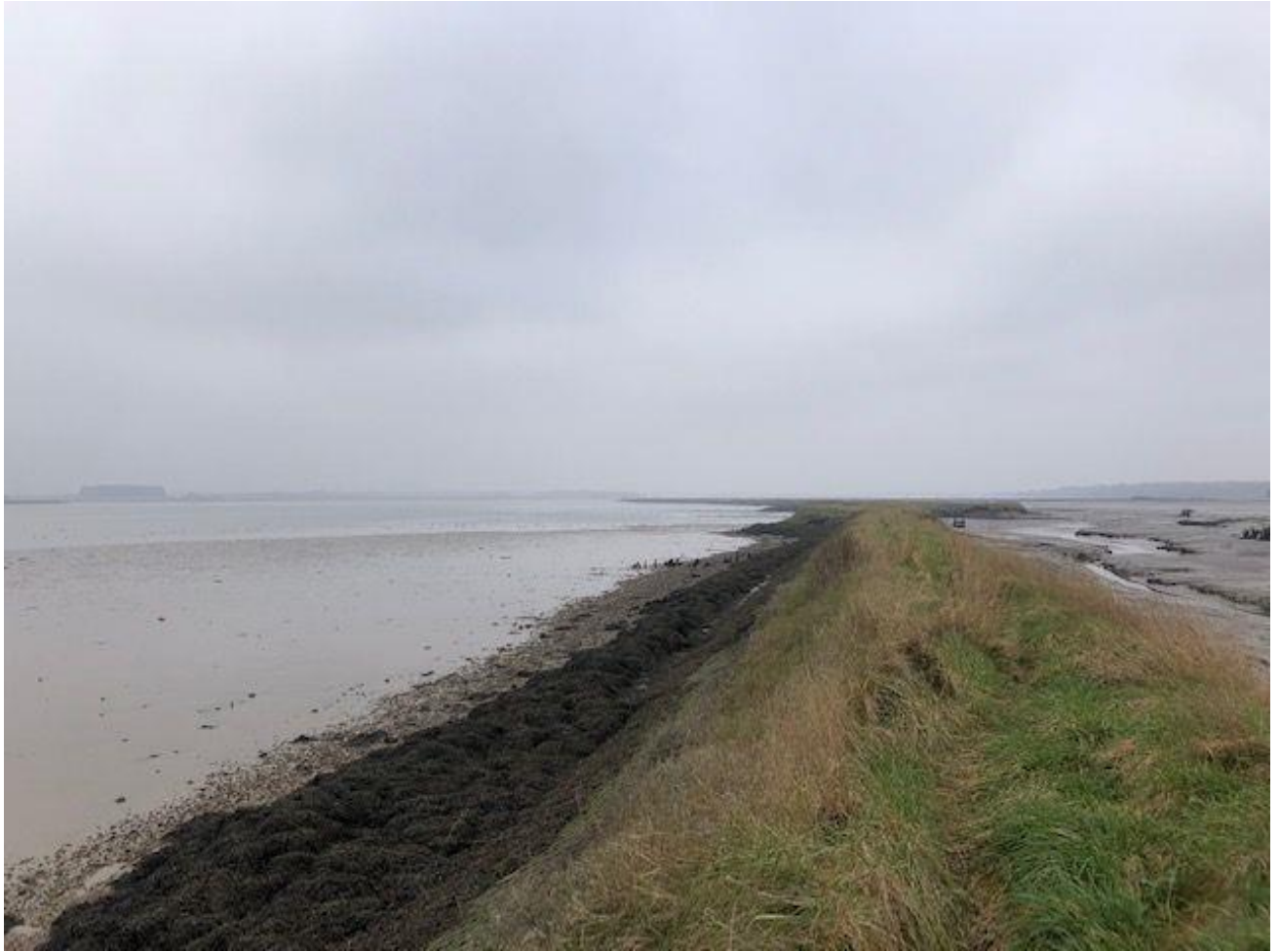
Wall separating river from marsh looking upstream towards Colliers Hole. Yarn Hill in the distance.