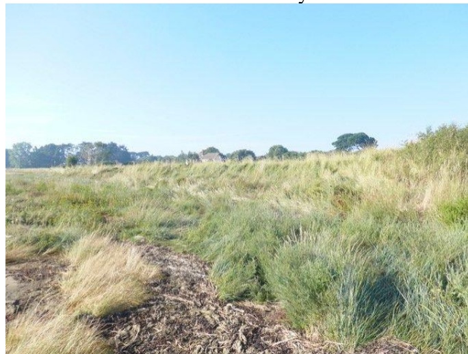
Debris with wall behind, Good vegetation. Rising ground beyond.