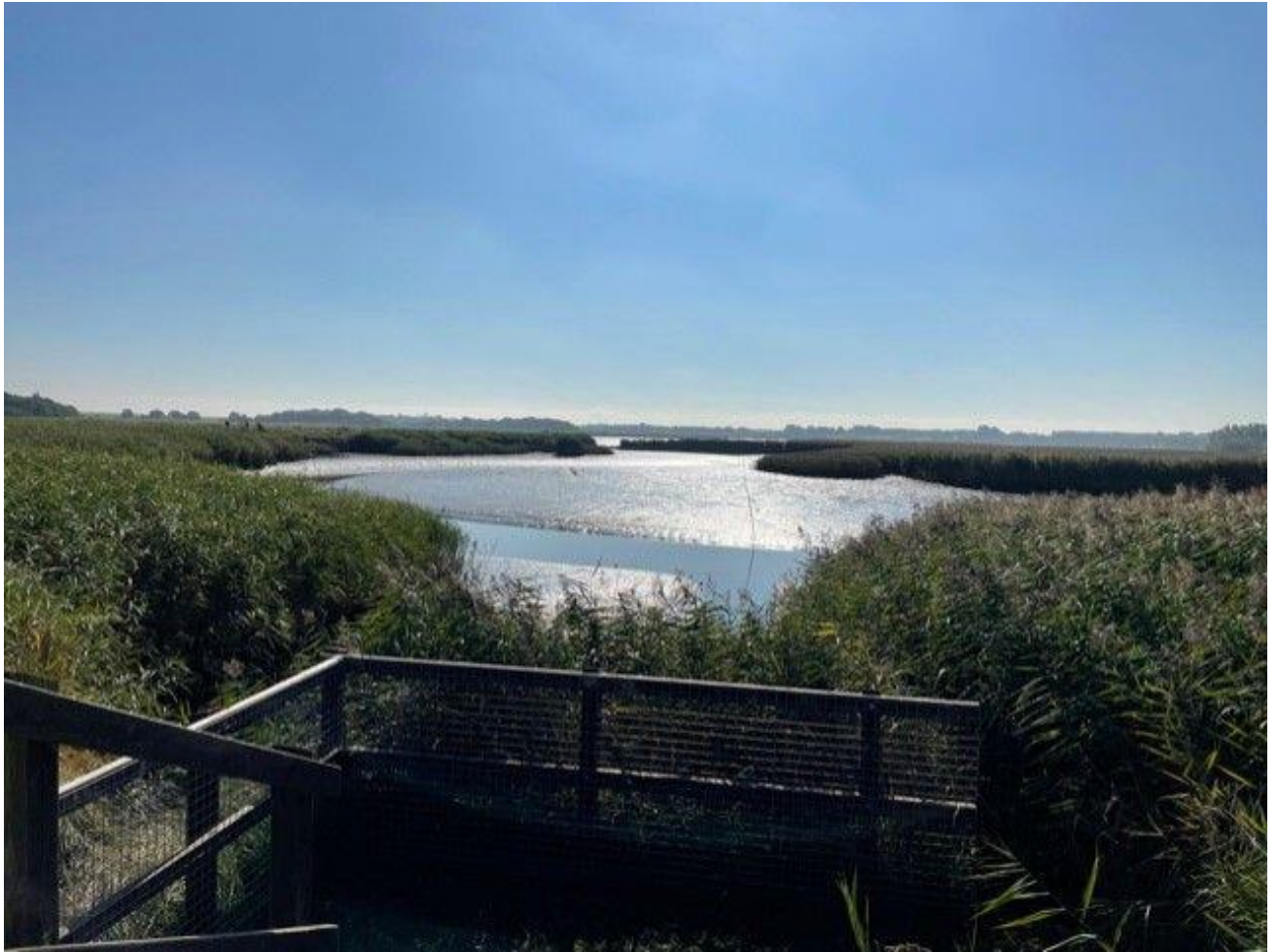
River channel showing mud flats at low tide