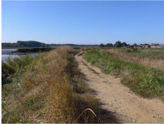
Wall with well used path and good vegetation each side