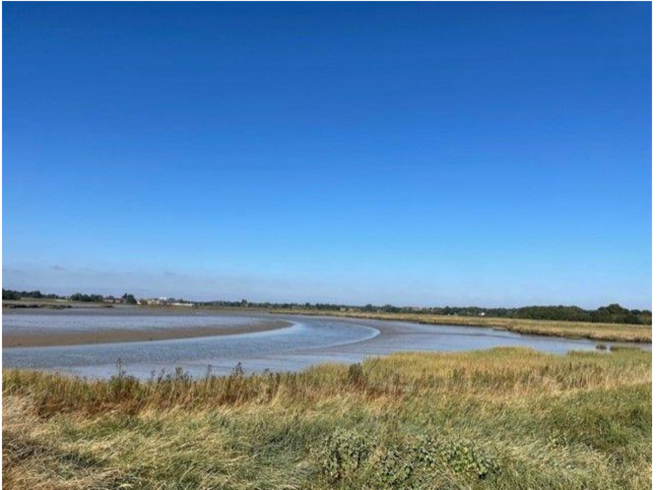
Beautiful Scenery looking towards the Maltings