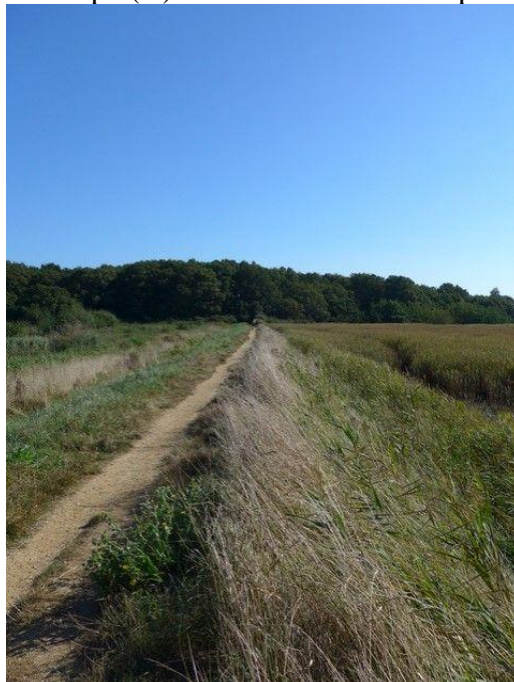
River wall looking towards Snape Warren. Reed beds in abundance.