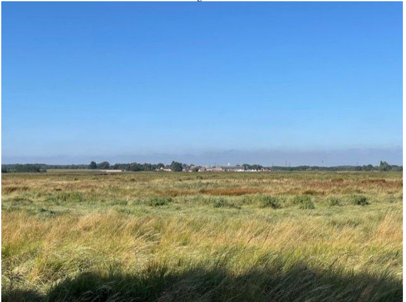
Marsh and saltings at Snape Warren