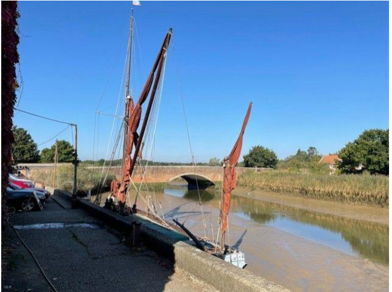
Snape Bridge with barge Cygnet on the quay