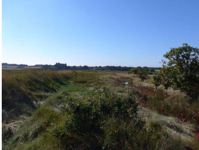
Inner slope (N) on to marsh land and pasture