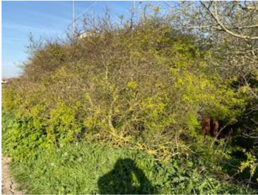
Photo 1 [shrubbery by Club House] [52 05 30.509 E1 32 27.318]

A section of the wall by the club house remains covered in shrubs. Other sections are being invaded by Alexander weed.