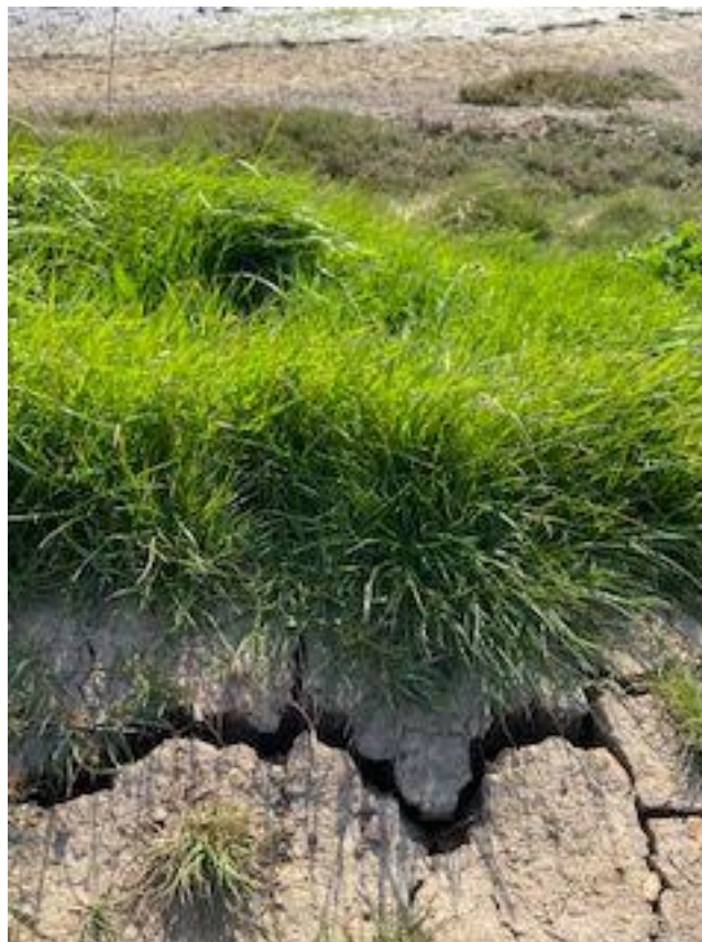
Photo 6 [cracked edge] [N52 05 18.19 E1 32 09.750]