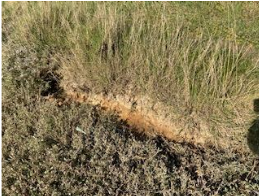
Photo 3 [undercutting at base] [N52 05 18.179 E1 32 09.948]

There is undercutting at the base of the wall near the village where there is no concrete armour. There is some damage to the armour itself in places but overall the amount of growth and seaweed makes it, difficult to see the detail.