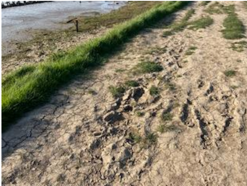
Photo 5 [eroded top] [N52 05 23.710 E1 32 09.269]

The top continues to erode, to the extent that parts are now starting to roll off at the edges. The section between the quay and the first stile is virtually unwalkable when wet and is in urgent need of attention.