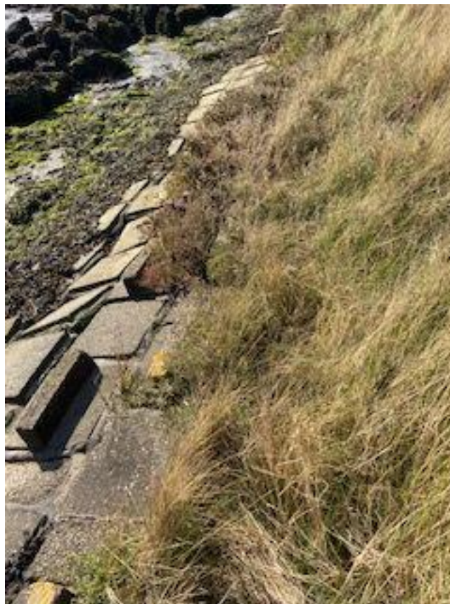
Photo 4 [armour] [N52 05 01.030 E1 32 13.458]