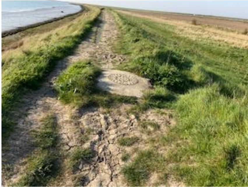
Photo 7 [manhole cover] [N52 05 14.659 E1 32 09 048]

Erosion around the dip by the manhole cover is particularly pronounced and the manhole cover appears to be slightly at an angle.