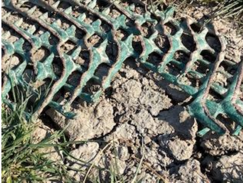
Photo 9 [mesh] [N52 05 03 199 E1 32 12.419]

Mesh is lifting at the stile end creating a new walking hazard.