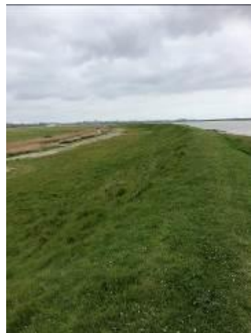
Twds Gedgrave PS TM411 475