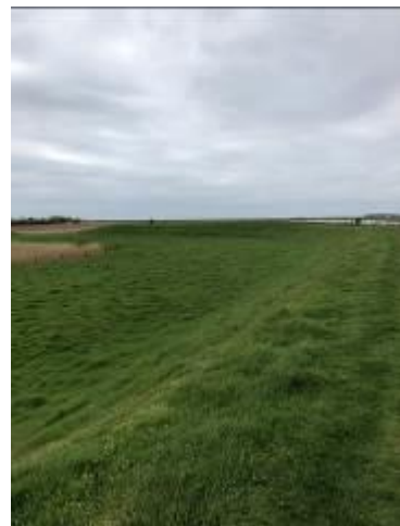
Above Ferry TM394 483