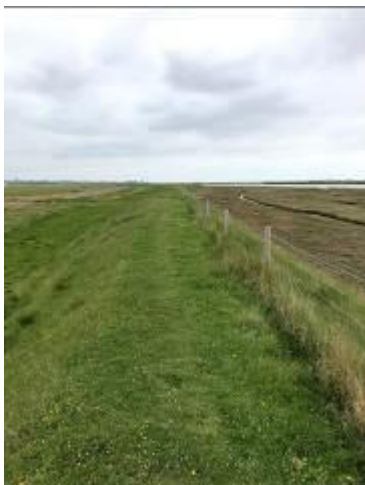
Path at Gedgrave PS TM407 472