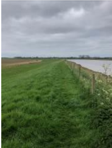
By Pinneys TM397486

Inner walls and pathway – all well grassed and no evidence of damage or change since last year; pathways occasionally showing deep cracking following a very dry month, but not slippage or decay.