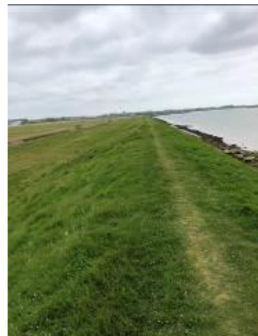
Towards Tide Gauge TM412 479