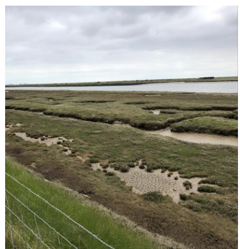
Some channel formation, undercutting: TM407 471

Outer Walls – generally good condition and no evidence of any change or deterioration