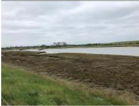
At Butley Ferry, TM 395 484

Saltings: once more, widening channels and undercutting at Butley Ferry, better elsewhere, though slight widening of inner channel along Long Gull.