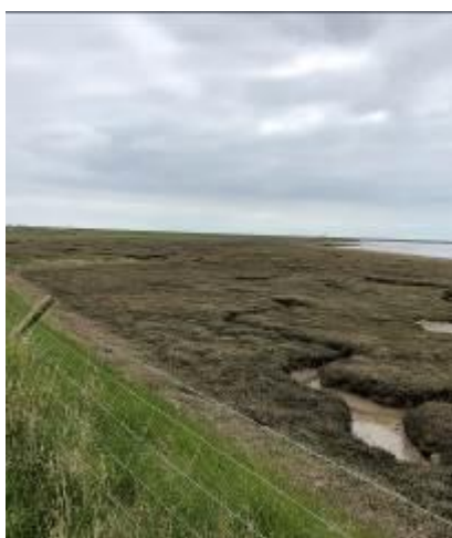
Better! Long Gull TM400 474