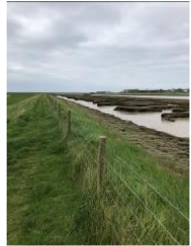
Channel widening TM394 479