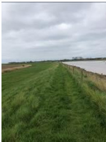
Opposite Ferry TM396 485