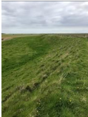
Above B Dock TM399 474