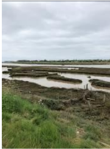
Above Ferry TM 394 482