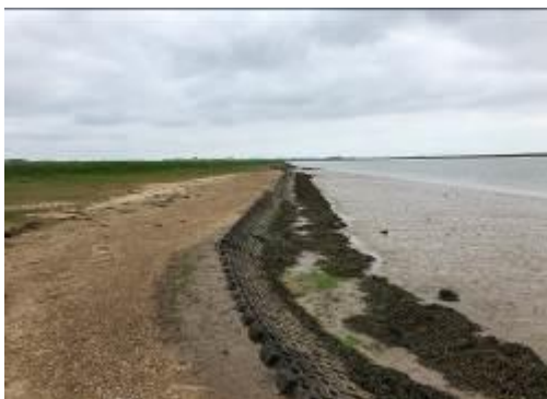
Armour at Gedgrave PS TM411 475

Outer Walls – generally good condition and no evidence of any change or deterioration