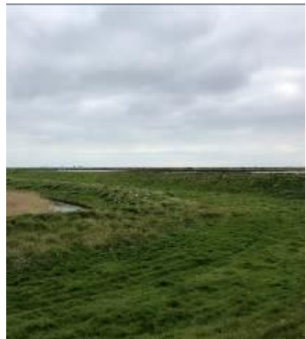
Towards Gedgrave PS TM406 472