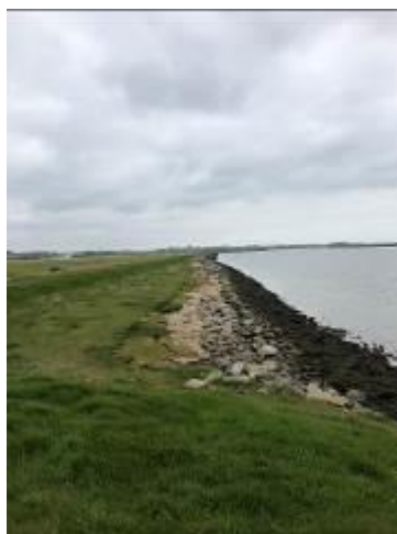
Shore twds Tide Gauge TM412 477