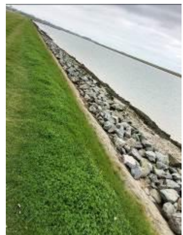
Further twd TG TM 412 478