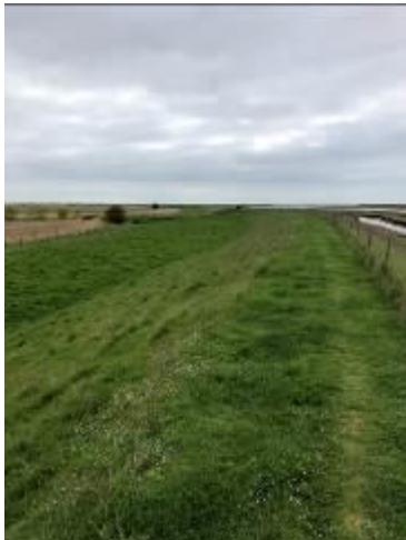
Boyton Dock TM395 474