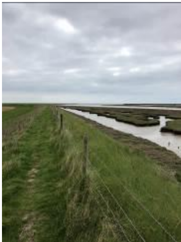
Channel above B Dock TM397 474