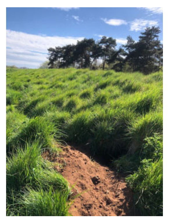
Badger hole 2

At chainage 9300 opposite Sparrow Hill Covert (see OS map) large badger sett towards top of east bank in current use (see photos).