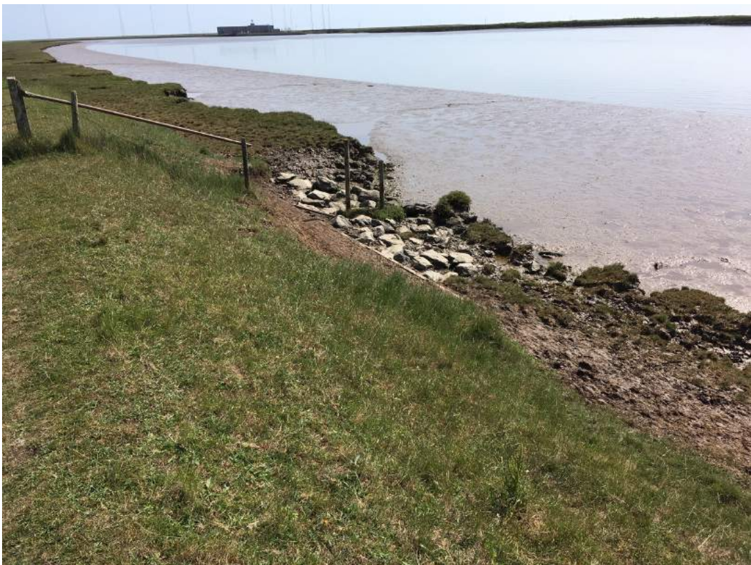
Erosion foot wall (GR 438500) No worse than last year