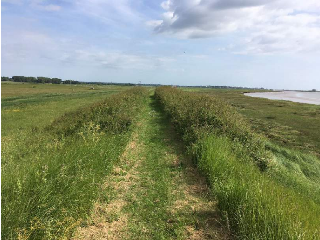
Bushes on either side of the river wall (GR 444516)