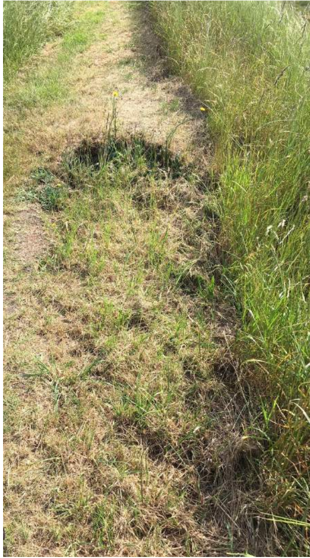
Slight hole/indentation on top of wall (GR 444510)