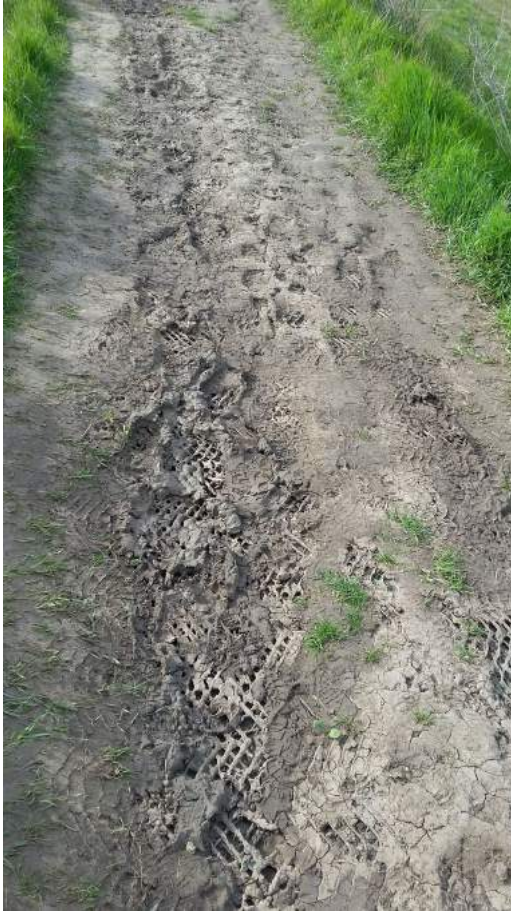
Photo 4 Another photo showing wear