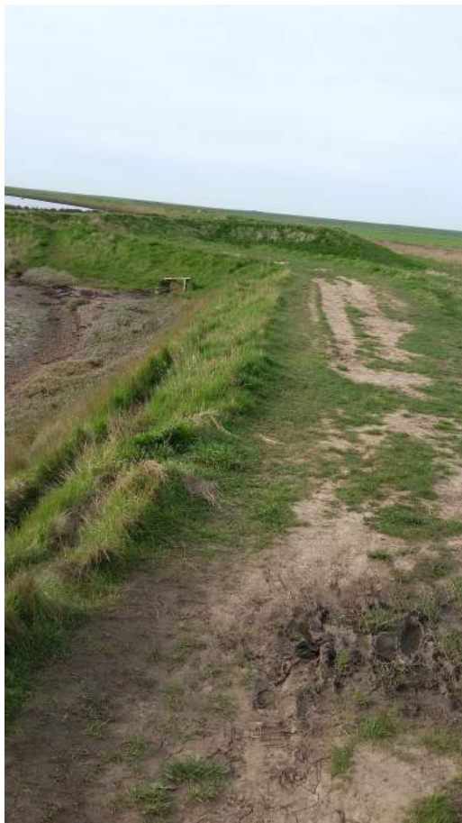
Photo 3 Increasing loss of grass cover