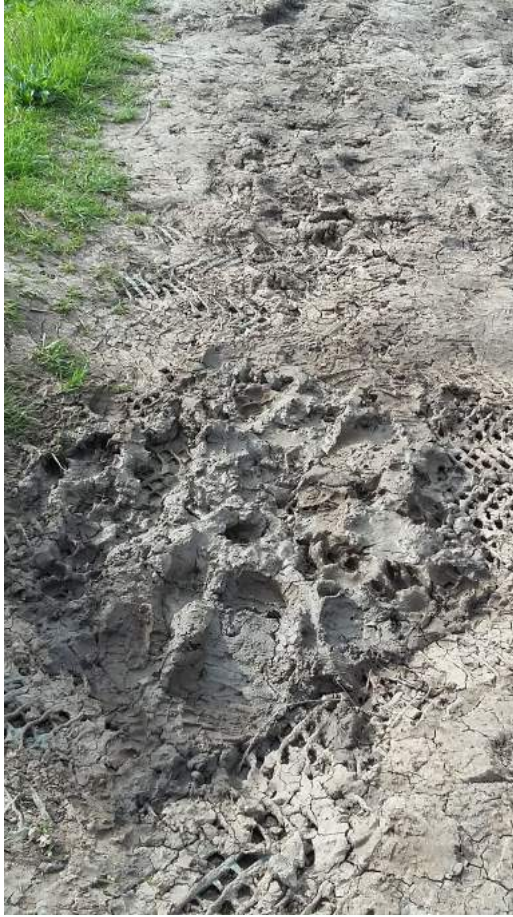
Photo 2 Surface turning to mud and exposing netting