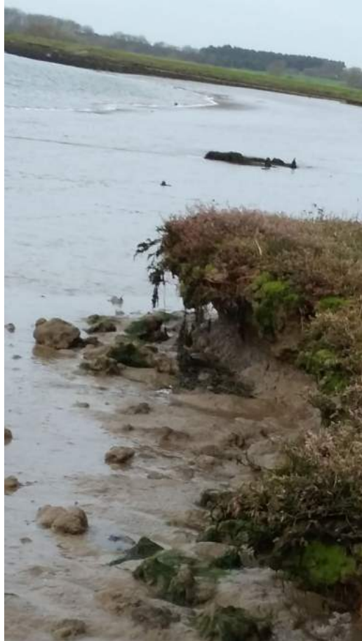
Photo 1 Erosion of saltings on Short Gull

The dips referred to in earlier reports are becoming more extensive.