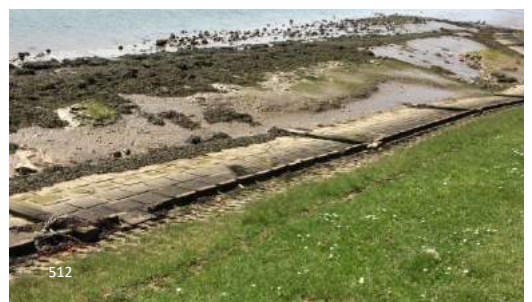
Revetment slabs buckling slightly at 411 476; worn and damaged pathway at this point; generally sound revetments and more evidence that (? sheep) a small track is being created at the outer foot of the wall at around 412 477.