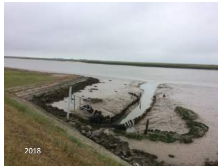
At the pumping station inlet (411 475) – 2017 on the left, this year on the right. No significant changes visible, but a build-up of debris and loose rocks.