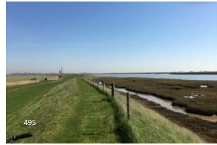
At 408 473, path towards the pumping station – fence posts have started to lean in again after recent repairs; saltings channel and some undercutting visible; general view.