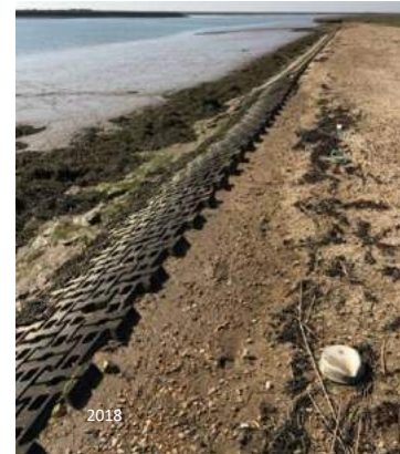
River wall revetment around 411 475, last year and this. At the top of the line of linked defence slabs the mud/shingle is washing away, leaving the top of the revetment exposed.