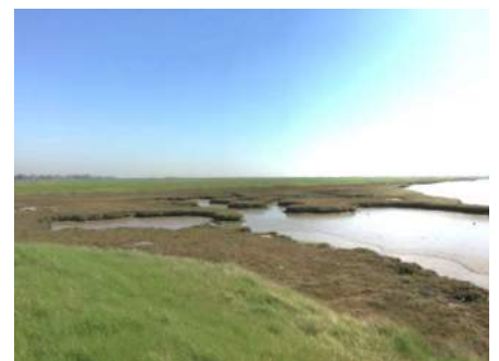
General view of saltings at Chantry Point, 415 484, over the last three years – path is worn but no significant change from last year; saltings and river walls largely unchanged, although some undercutting evident here as elsewhere.