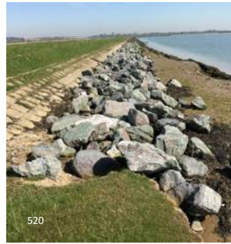
Coming towards Chantry Point – rock defences and bare patches in the pathway and outward wall at 412 477; more recently placed rock defences at 412 478