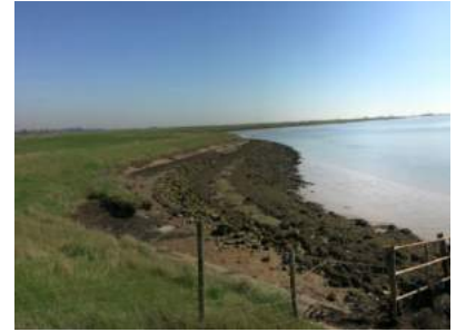
Last stretch towards Chantry Point – pathways in poorer condition than elsewhere in this part of FC4, some mud and seaweed covering up generally sound revetments, no significant changes.