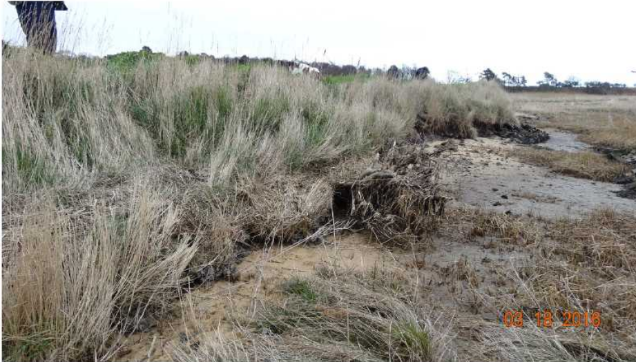
Ham Creek debris at toe of wall and saltings to the right.