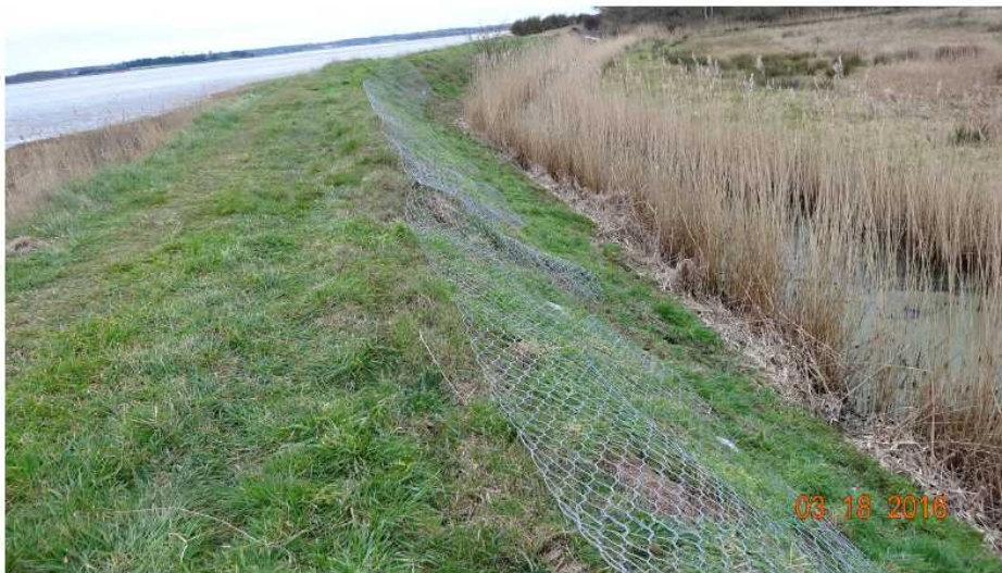
Ham Creek river wall with anchored mesh on the back slope.