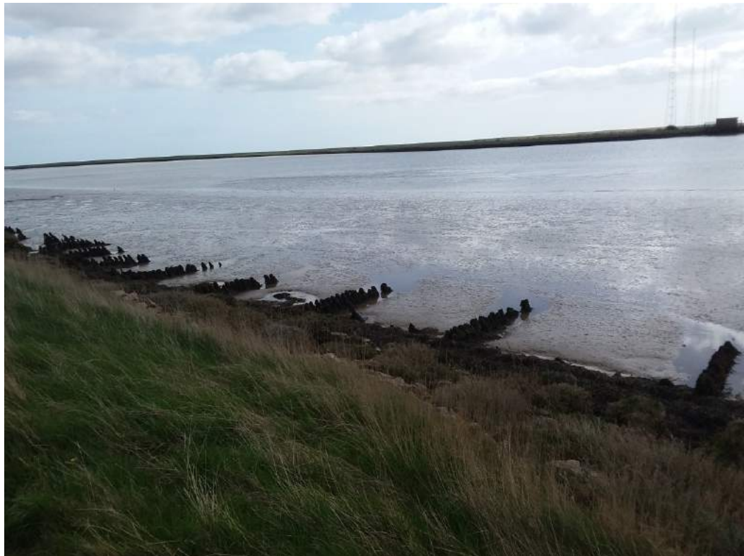
Photograph 2 (N 52 6.755 E 001 34.024)