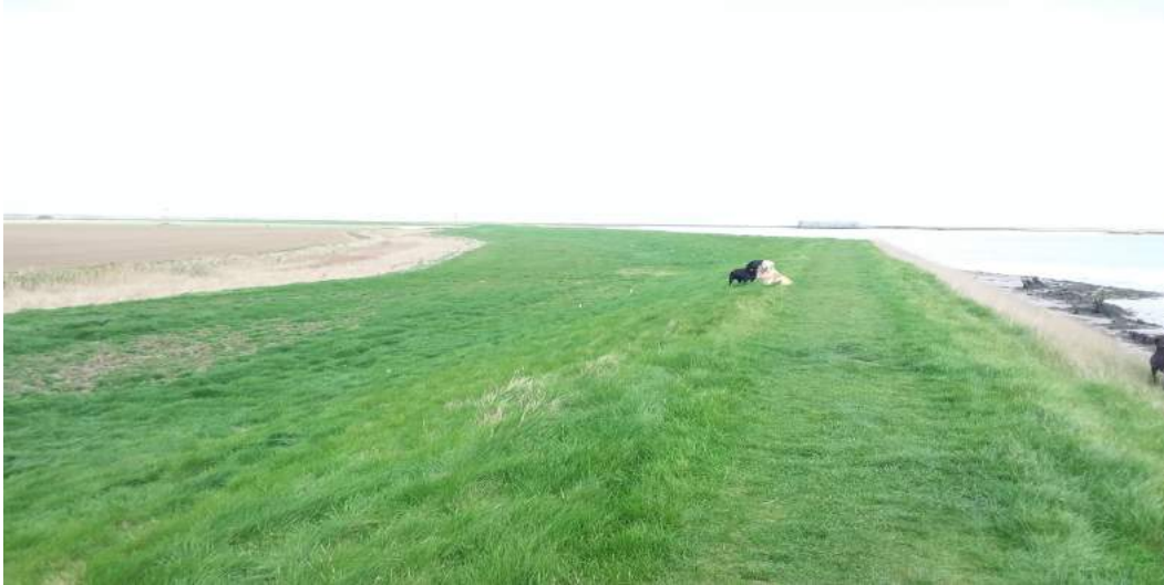
Photograph 1 (N 52 6.755 E 001 34.024)

Funding and design for restitution being arranged by the Saltmarsh Group and Environment Agency. Up to 1000m are vulnerable. The area of distinct erosion is a priority to avoid wave action on river wall.