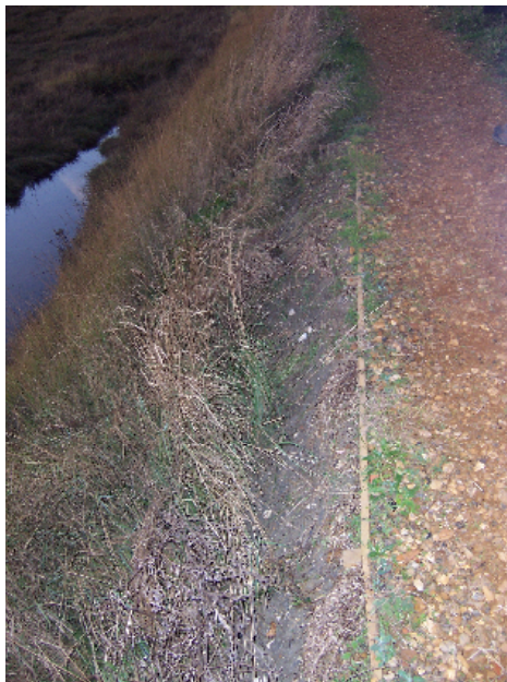
Debris :long stretches lapping wall top, along Brick Dock stretch, this bit with seaweed