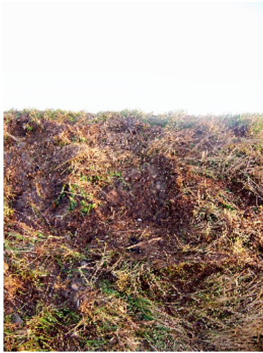
Bare earth , newly emerged on front of all near Slaughden/Iona saltings 463556